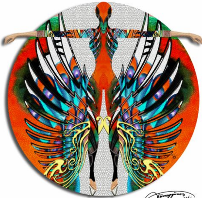
"Wings Of Peace"