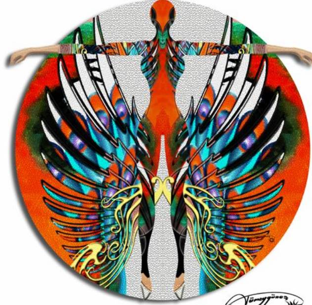
“ Wings Of Peace ” 97 x 95 cm “ illustrative illusion “mixed media ”